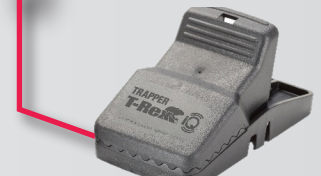
TRAPPER ® T-Rex iQ ™

Instead of time spent checking rodent devices with no activity, pest control experts can spend their time solving problems.