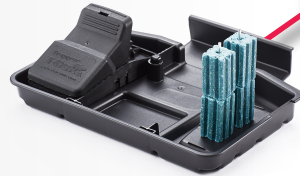
Protecta EXPRESS ® iQ ™