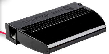
TRAPPER ® 24/7 iQ ™