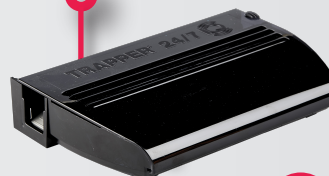
TRAPPER ® 24/7 iQ ™